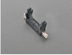
03 161 knife link 160 A size 00